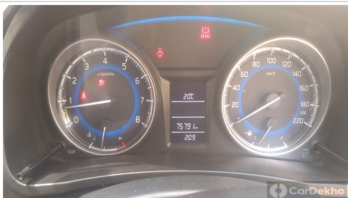
Odometer reading (with engine on from driver seat)