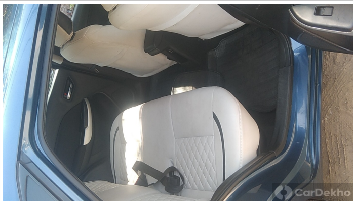
Rear Right or Left Side Interior View