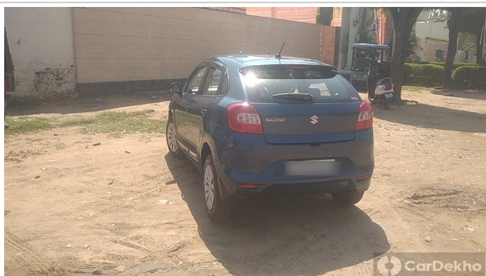
Rear Side- Left Edge