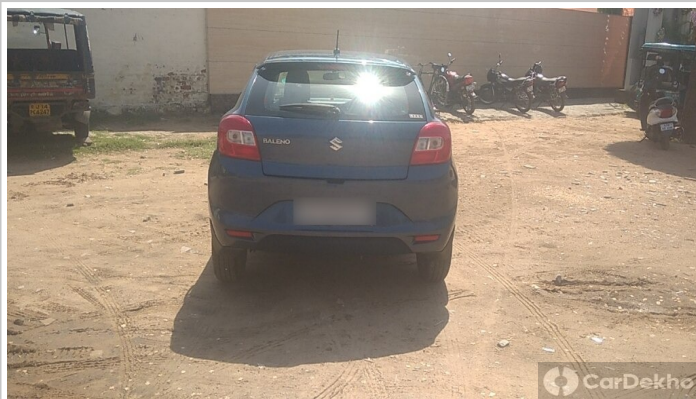
Rear (bumper, dicky door, rr-windshield, tail lights)