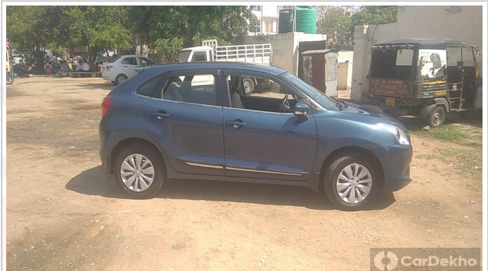
Right Side - Front Edge