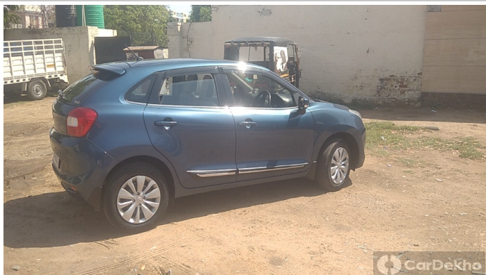
Right Side (fender, doors, qtr Panel)