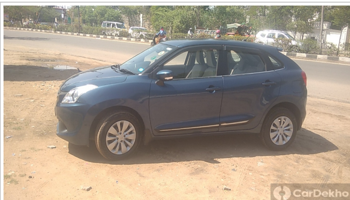
Left Side-Front Edge