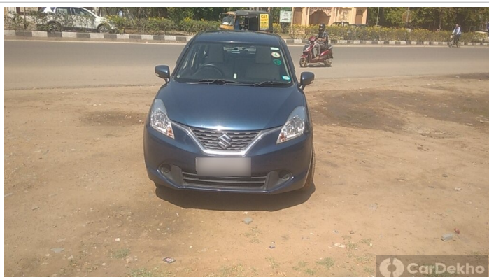
Front View (bumper, bonnet, fr-windshield,headlights, grill)