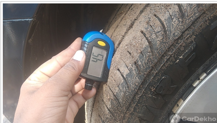
Front Left Tyre