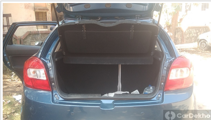
Boot / Dicky