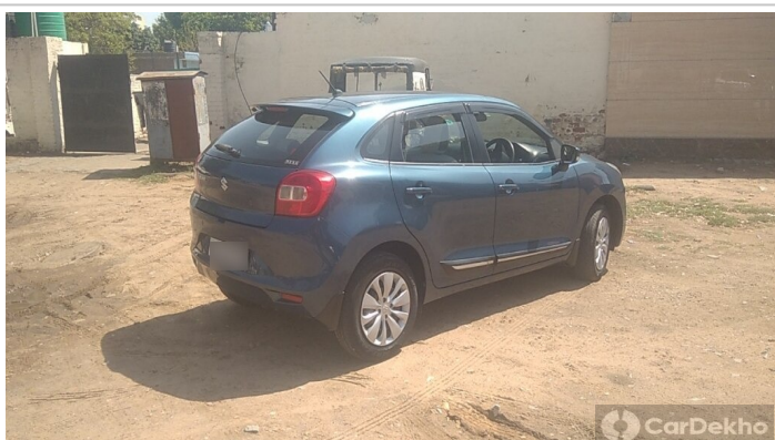
Right Side-Rear Edge