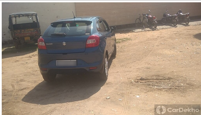
Rear Side- Right Edge