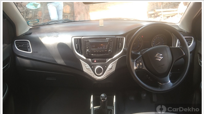
Dashboard ( from rear seat)