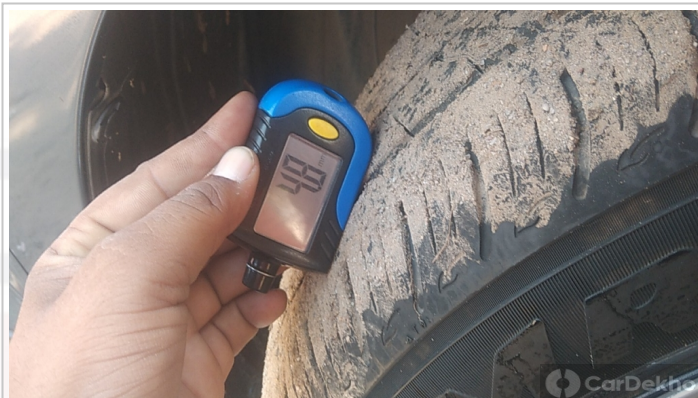
Front Right Tyre