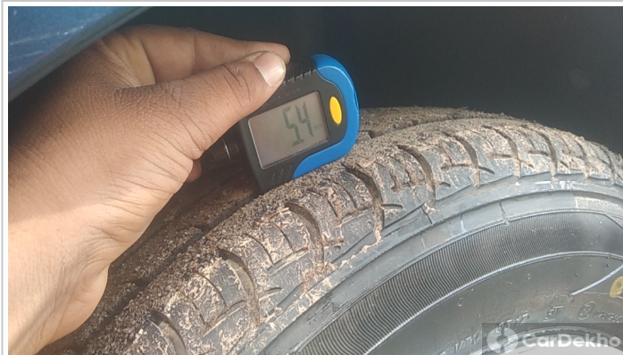
Rear Left Tyre