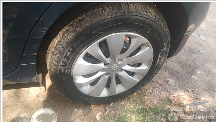
Rear Left Tyre