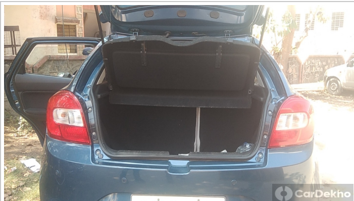
Boot / Dicky