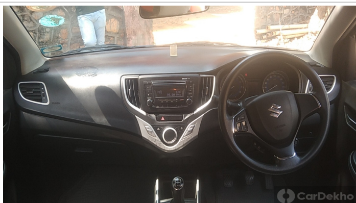
Dashboard ( from rear seat)