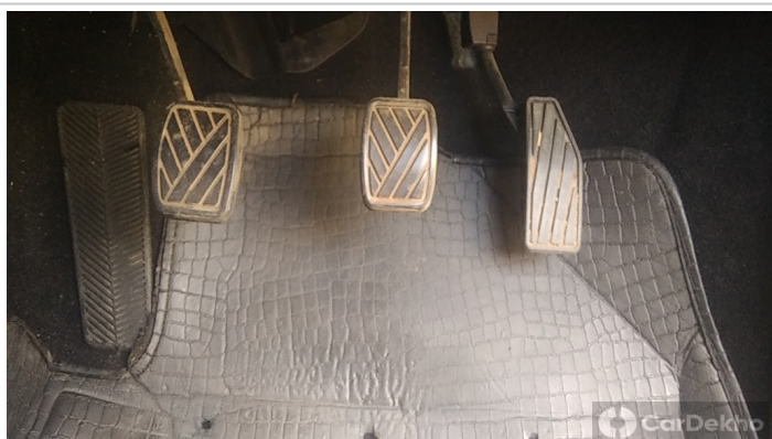
ABC Pedals ( from driver seat)