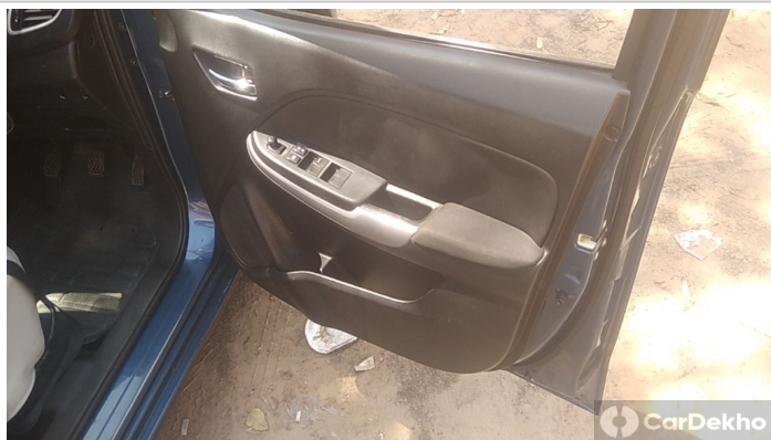
Front Door Trim