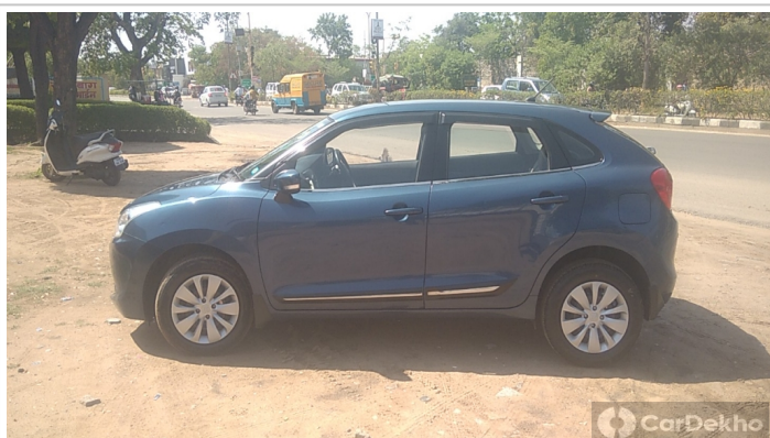
Left Side (fender, doors, qtr Panel)