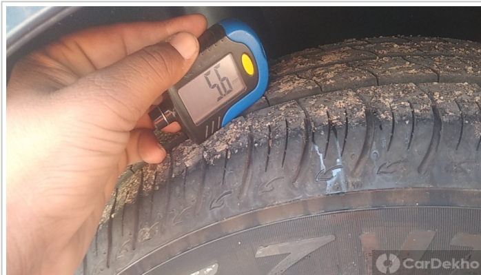
Rear Right Tyre