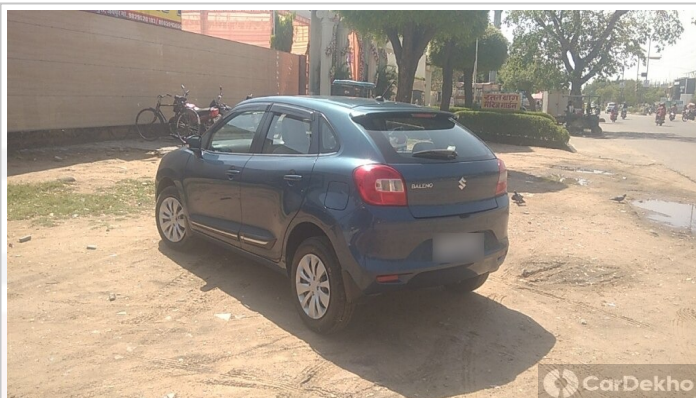
Left Quarter Panel