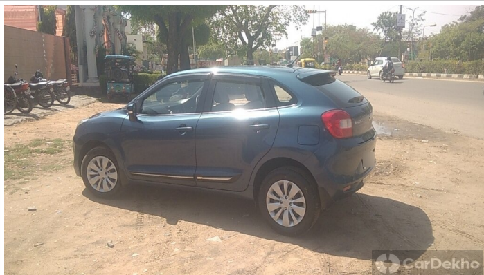
Left Side-Rear Edge