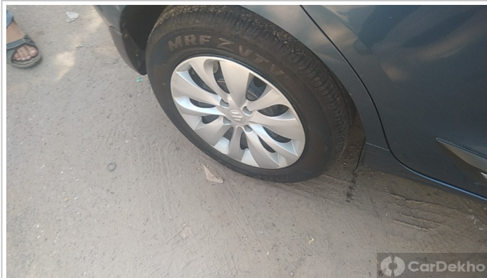
Rear Right Tyre