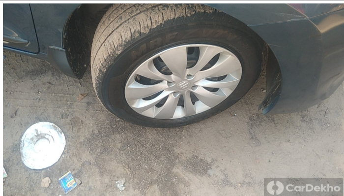
Front Right Tyre