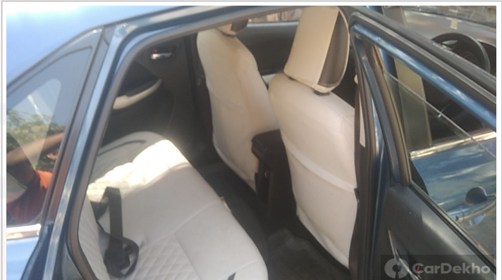
Rear Right or Left Side Interior View