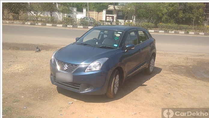
Left Side Profile Pic