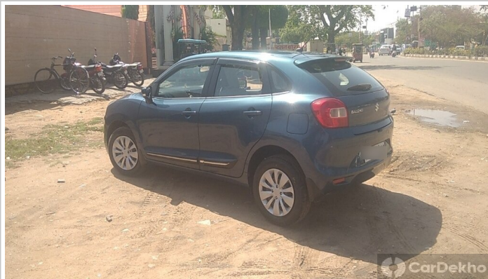
Left Side (fender, doors, qtr Panel)