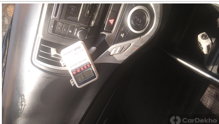
Ac Cooling image