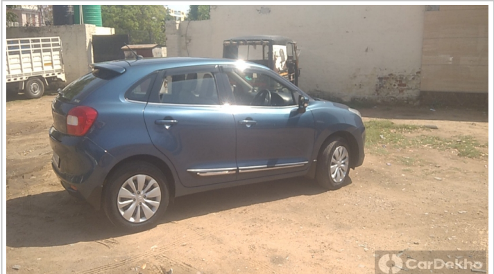
Right Side (fender, doors, qtr Panel)