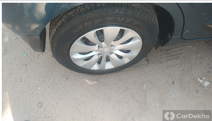
Rear Right Tyre