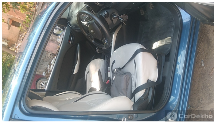
Front Right or Left Side Interior View