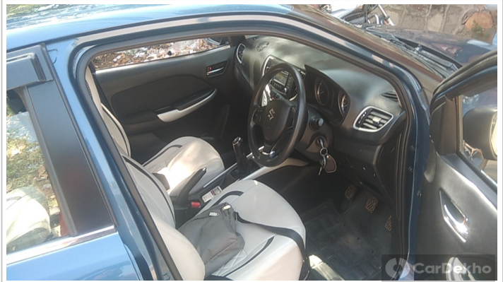
Front Right or Left Side Interior View