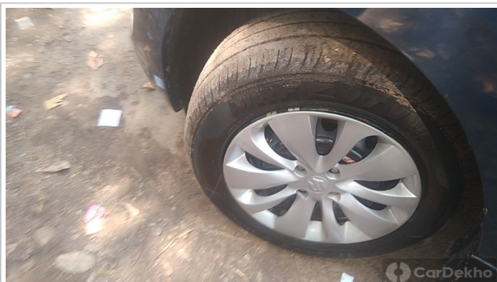
Front Left Tyre