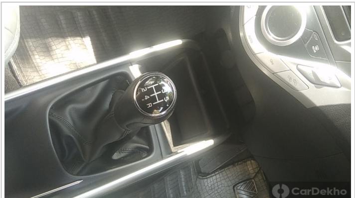
Gear Shift Lever ( from rear seat)